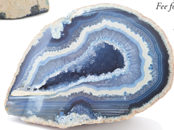
Aug 24 11:00 AM