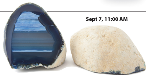
Sept 7, 11:00 AM