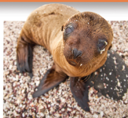
Aug 10, 11:00 AM