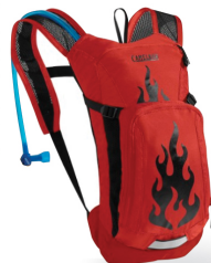
Aug 17 11:00 AM

Donations Optional: adults $3, youth 5-18 $2, and under 5 free.